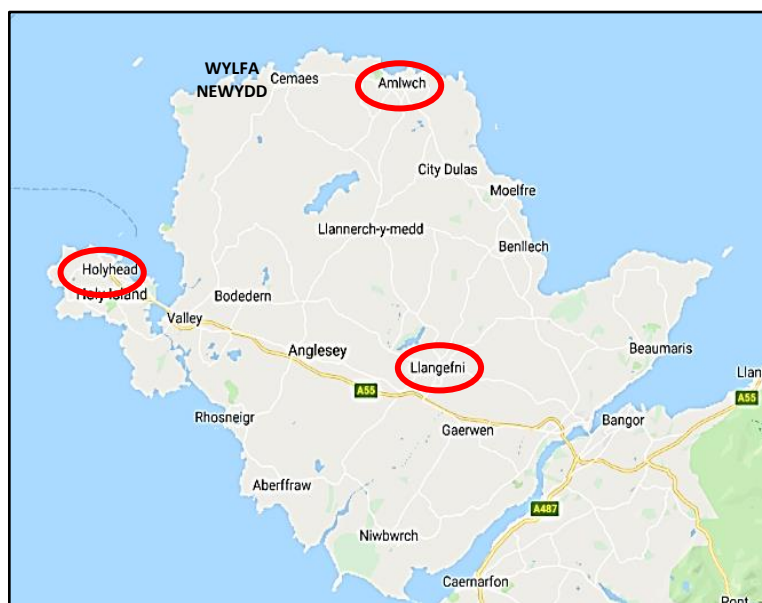
Fig 3: Main Settlements.